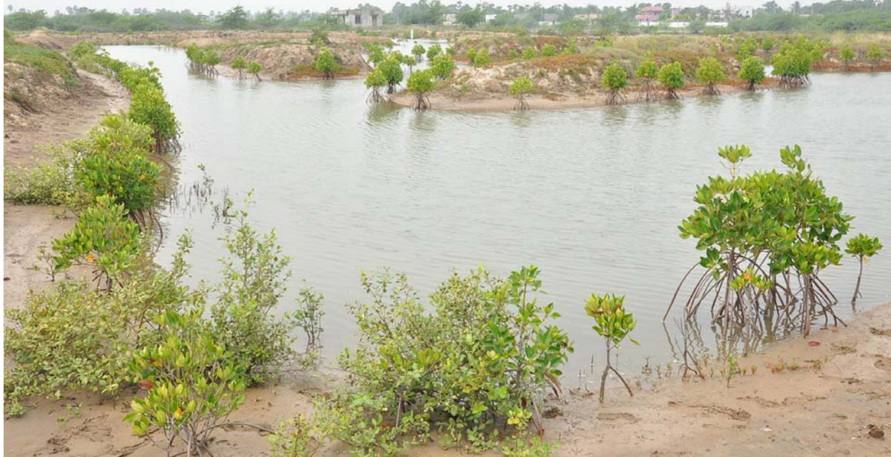
Community based adaptation pilot on Integrated Mangrove Fishery Farming System implemented in Tamil Nadu by the Indo-German project CCA RAI.

H ow can successful experiences in addressing the challenges of rural India be scaled up? This is a critical question that practitioners have been grappling with in the development context for many decades. It has become even more important in the context of adaptation, as India's rural communities are threatened with rapid and extreme climate change.