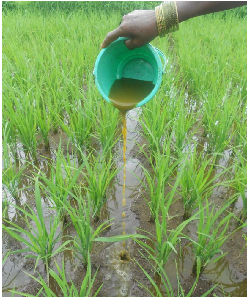
Villager applying Amrutpani to their farm–Organic Manure.

Water resource conservation has been the maxim of WOTR through augmenting water resources via watershed development and managing water within the watershed through careful and planned water budgeting specially in the drought prone region of