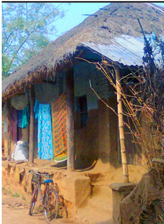
House on elevated base.

Jamsetji Tata Centre for Disaster Management, Mumbai