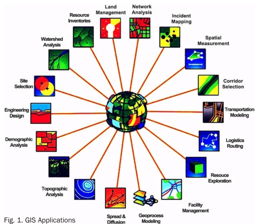
Fig. 1. GIS Applications

It is a typically a methodology used to link community resources with an agreed upon vision, organizational goals and expected outcomes. The community resource mapping process can help a community It convey information about an agency's policies, procedures, funding streams and new opportunities for community planning.