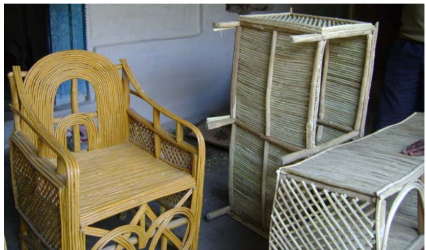
Furniture made of Lantana- an invasive species.

There is a box of adaptation which has been formed by on-ground experiences, success and failure of WOTR with the people, communities