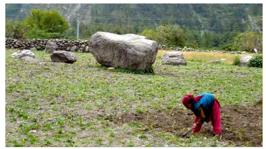
Marginalized agricultural practice and sedimentation in cultivated land making more vulnerable to Disaster

Agriculture Practice: Agriculture sector contributes nearly 35% of the Nepal's GDP and supports the livelihood of more than 74% of Nepal's Population (NLSS, 2007 and CBS, 2012). Only about 25% of Nepal's surface area is suitable for agriculture purpose. About 21% of the land is cultivable of which 54% has irrigation facilities (MoAD, 2012) and remaining is the rain fed. The agriculture practice is governed and guided by rainfall and totally dependent on climate. Due to increasing population, safe land is scarce and people are occupying marginal lands for their livelihood