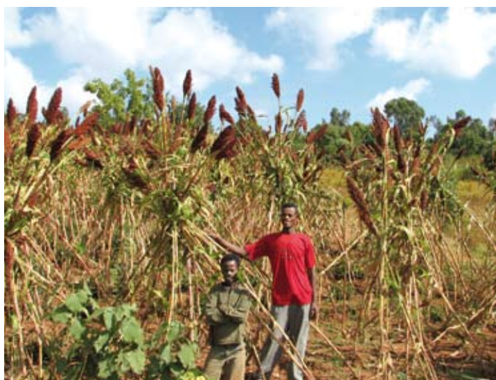
Farmers generally prefer local landraces of sorghum in Ethiopia

However, there is an element of risk when you consider the difference between seed and food grain. Food grain can be damaged and broken seed, not uniform in size, low in germination, and a mixture of varieties, and yet be acceptable for sale or consumption, but which would not be good for planting. Seed for planting must be able to germinate and produce