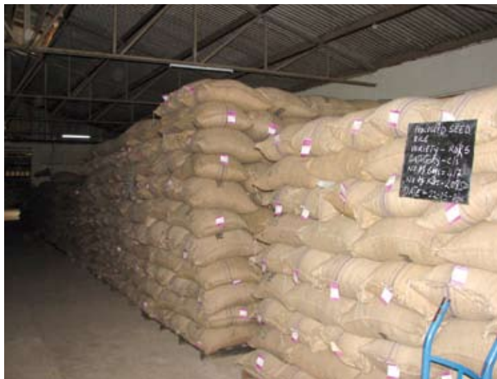
Seed must be stored properly to limit seed deterioration. Here, seeds are stored on pallets to prevent humidity from migrating in the bags.