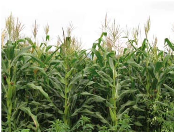
Male flowers of maize—producing pollen that will generally pollinate female flowers of other plants of maize. The resulting cob will carry seed of a hybrid of the two plants.

Hybrids are produced by the cross-pollination of unlike parents of the same crop. In very simple terms, parent plants are selected for certain traits and are self-pollinated for several generations to produce “inbred lines”. These inbred lines are then cross-pollinated to produce the F1 generation, which is known as a hybrid. Because the parents are genetically dif-