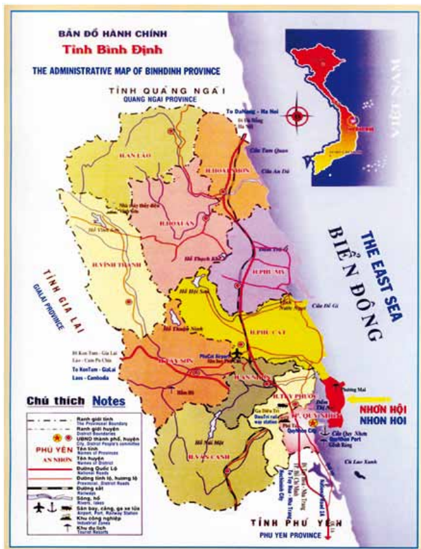
Figure 1: Administrative map and location of Binh Dinh province

Binh Dinh province's numerous and interlaced river systems encourage increased climatic interactions between marine and terrestrial environments. Flooding is common, especially during the rainy season from September to December, when 79% of precipitation occurs. Flash floods, droughts, fires, saline intrusion, and desertification are common, as is erosion along river banks and coastline. Major storms occur frequently. In the recent decades, Vietnam has experienced roughly five tropical cyclones per year. The central region, from Binh Dinh to Ninh Thuan, is among the hardest-hit, averaging 1.1 cyclones per year from 1961 to 2008 (The World Bank, 2010). The main impacts of storm events in Binh Dinh have been shoreline erosion, flash flooding and environmental pollution. 2 The areas most affected by flooding are the lowlands in Tuy Phuoc, An Nhon, Phu Cat, Phu My, and Quy Nhon. 3 In 2009, 2010 and 2011, Binh Dinh province was seriously affected by floods. Flooding in October and November 2011 resulted in several deaths and economic losses of around US$35 million. 4