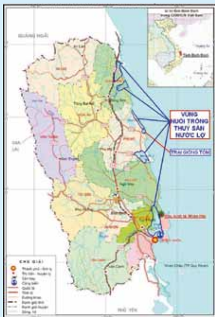
Figure 4: Brackish aquaculture areas in Binh Dinh

(Note: "Vung Nuoi trong Thuy San Nuoc Lo" = Brackish water aquaculture areas and "Trai Giong Tom" = Shrimp Variety Production Unit)