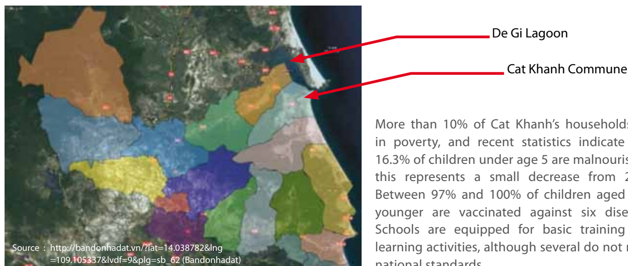
Figure 3: Cat Khanh Commune in Phu Cat District

More than 10% of Cat Khanh's households are in poverty, and recent statistics indicate that 16.3% of children under age 5 are malnourished; this represents a small decrease from 2008. Between 97% and 100% of children aged 5 or younger are vaccinated against six diseases. Schools are equipped for basic training and learning activities, although several do not meet national standards.