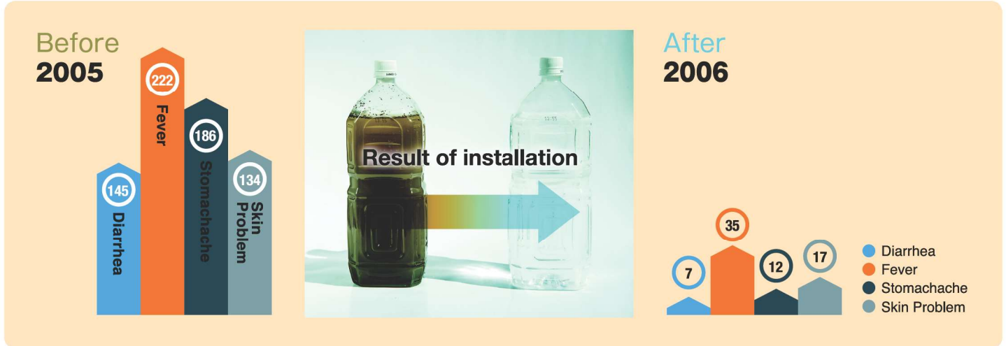
Hearing survey at Wanasari, Indonesia in 2006

This lowers the risk of diarrhea, among other illnesses caused by lack of sanitation.