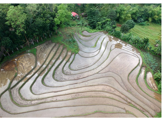
Left: Mangroves in the Negros Occidental Coastal Wetlands Conservation Area. Right: Terraced rice fields in Barangay Orong, Kabankalan, Negros Occidental.