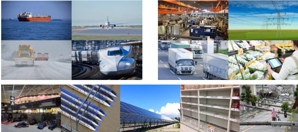
Natural disaster prevention and CO2 reduction