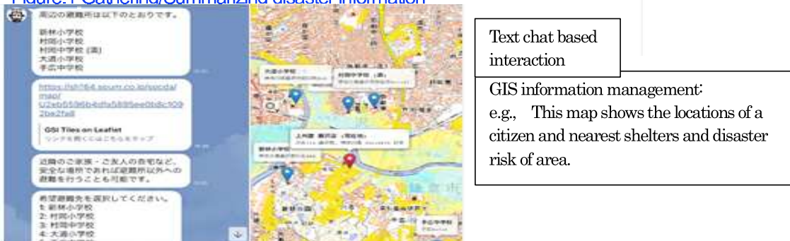
Figure.2 Provide information about evacuation