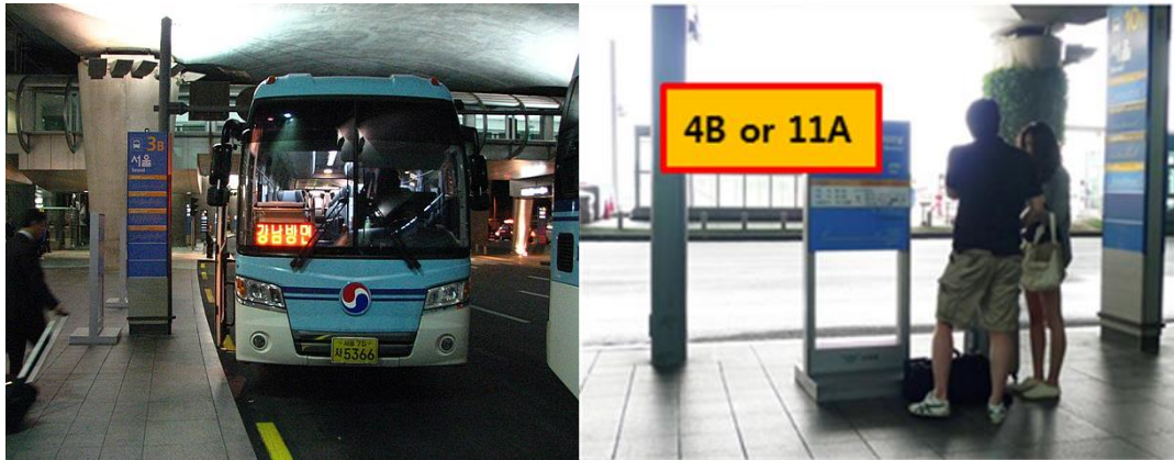
<KAL Limousine Bus><KAL Limousine Bus stop>