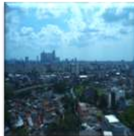
GIZ supported climate proofing trainings on investments