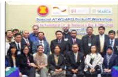
Climate Resilient Network (ATWGARD)