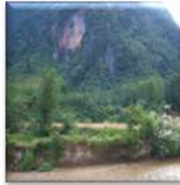
ASEAN Integrated Food Security (AIFS)