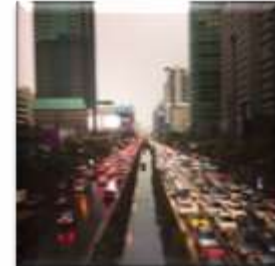
ASEAN Multi-Sectoral Framework on Climate Change